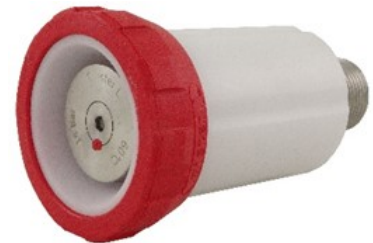
TWRWR02L 3/4" BSPP male, 60° conical seal