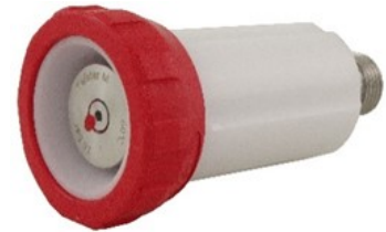
TWRWR02M 1/2" BSPP male, 60° conical seal