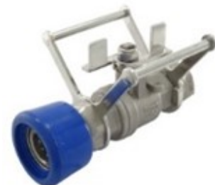
BARRCP2-B Stainless steel 316; 1/2" BSP female x quick coupling with EPDM protection

All article numbers in bold are available from stock.