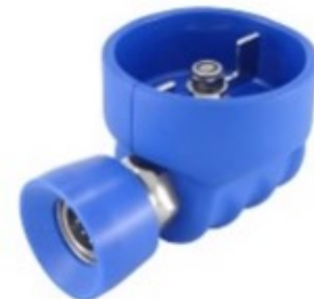
BALRCP1-NB Stainless steel 304; 1/2" BSP female x quick coupling with nylon protection