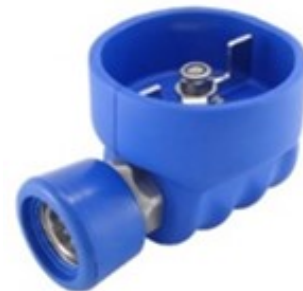
BALRCP1-B Stainless steel 304; 1/2" BSP female x quick coupling with EPDM protection