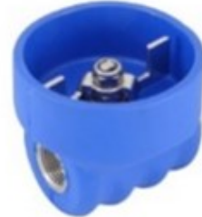
BALR001-B In stainless steel 304; 2x 1/2" BSP female