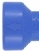
Arrow for jet direction