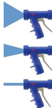
Water flow when trigger is fully squeezed, depending on pressure.