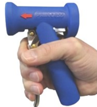
BRFT001-B In stainless steel AISI 316

All article numbers in bold are available from stock.