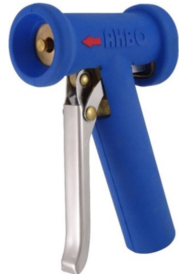
BMFT001-B In brass